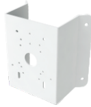
TD-YZJ0601 Corner Mount